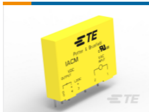
TE Part # 1393028-7 SLIM INPUT AC MOD, 15V DC LOGIC- 120VAC IP