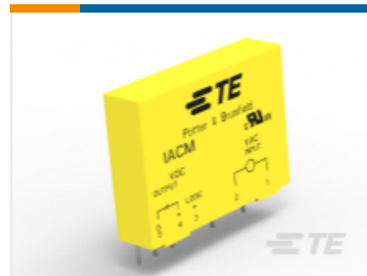
TE Part # 8-1393028-9 SLIM INPUT AC MOD, 24V DC LOGIC- 120VAC IP